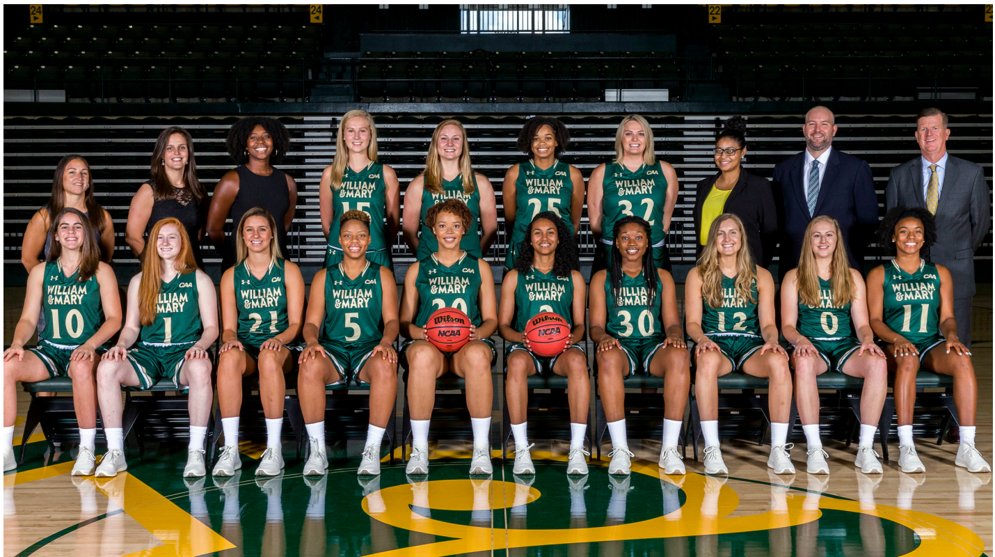
2018-19 Tribe Women's Basketball