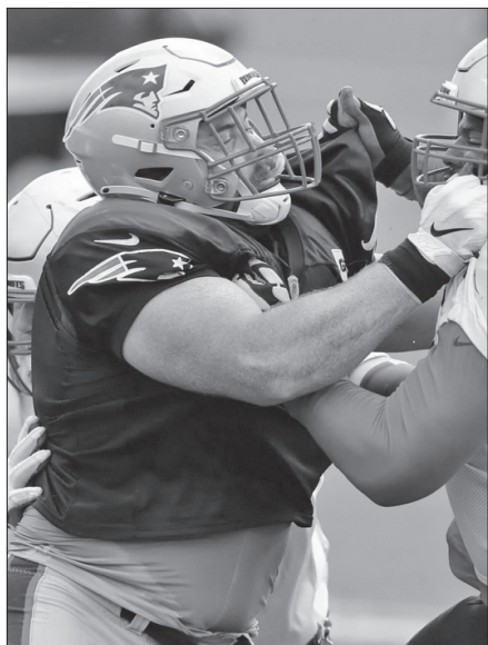
Bill Murray New England Patriots