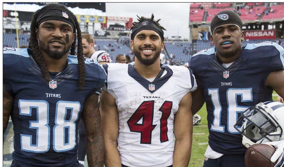
W&M's six NFL Draft picks since 2009 leads the CAA and ranks second among all FCS programs. Additionally, it ranks behind only Virginia and Virginia Tech in the state of Virginia.