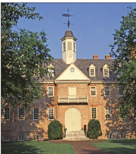
Established in 1693, William & Mary is the second-oldest college in the country. U.S. News and World Report recently ranked W&M sixth in its list of the nation's top public schools.