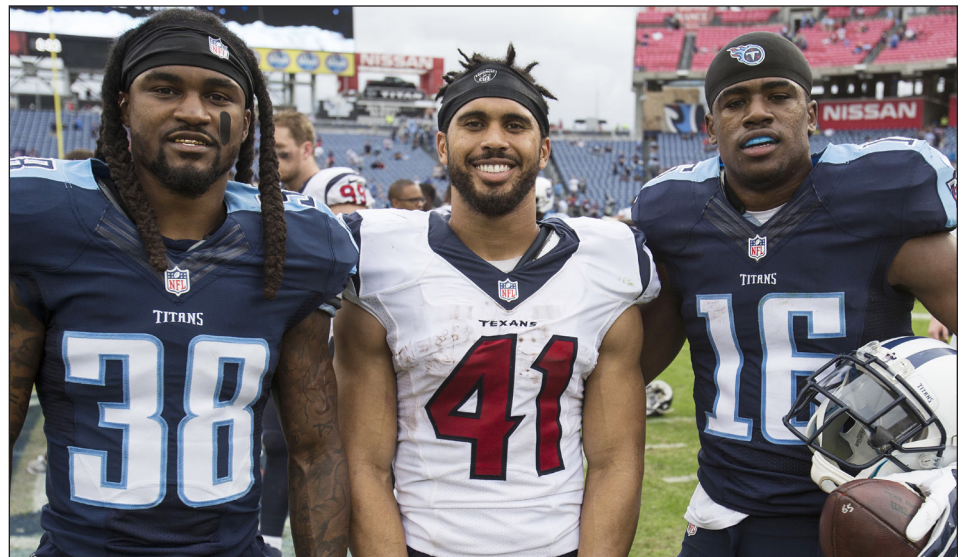
W&M's six NFL Draft picks since 2009 leads the CAA and ranks second among all FCS programs. Additionally, it ranks behind only Virginia and Virginia Tech in the state of Virginia.

Dating back through the 2011 season, W&M has struggled to win games in which it has thrown at least 30 passes and owns an 8-22 mark in such contests.