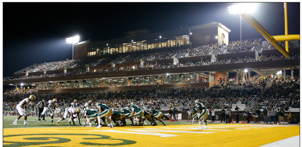
The William & Mary football program boasts some of the finest facilities at the FCS level, as the $28 million Zable Stadium renovation was completed in 2016 and sits adjacent to the team's $11 million Jimmye Laycock Football Center. The recent stadium renovation also includes the addition of a new state-of-the-art playing surface – FieldTurf Revolution 360.

The chart below indicates those national rankings during