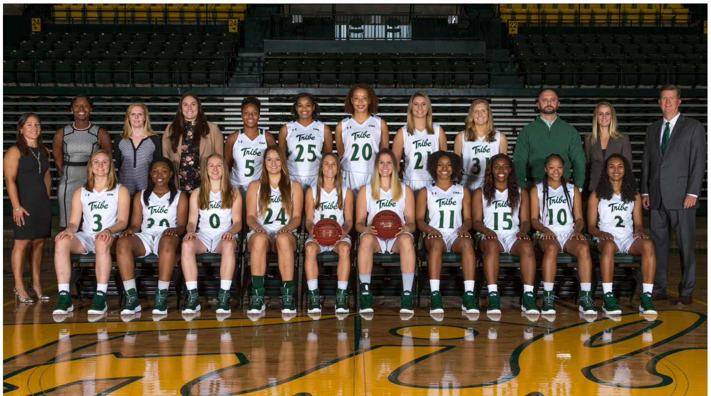
2017-18 Tribe Women's Basketball