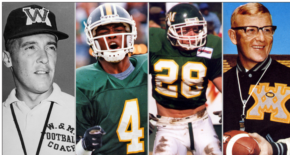
Mike Tomlin, Sean McDermott, Marv Levy and Lou Holtz all have ties to W&M. Tomlin (1990-94), a wide receiver, and McDermott (1993-97), a safety, are both former team captains, while Levy (1964-68) and Holtz (1969-71) both served as head coaches.