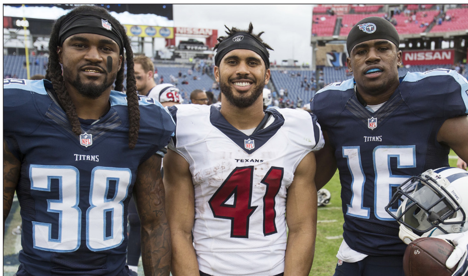
W&M's six NFL Draft picks since 2009 leads the CAA and ranks second among all FCS programs. Additionally, it ranks behind only Virginia and Virginia Tech in the state of Virginia.