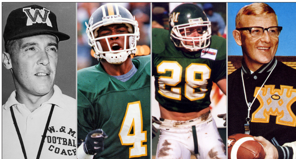
Mike Tomlin, Sean McDermott, Marv Levy and Lou Holtz all have ties to W&M. Tomlin (1990-94), a wide receiver, and McDermott (1993-97), a safety, are both former team captains, while Levy (1964-68) and Holtz (1969-71) both served as head coaches.